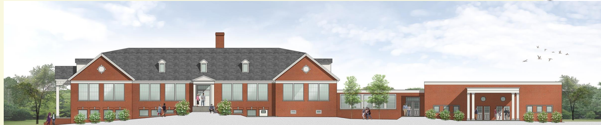
23 Apartment Homes