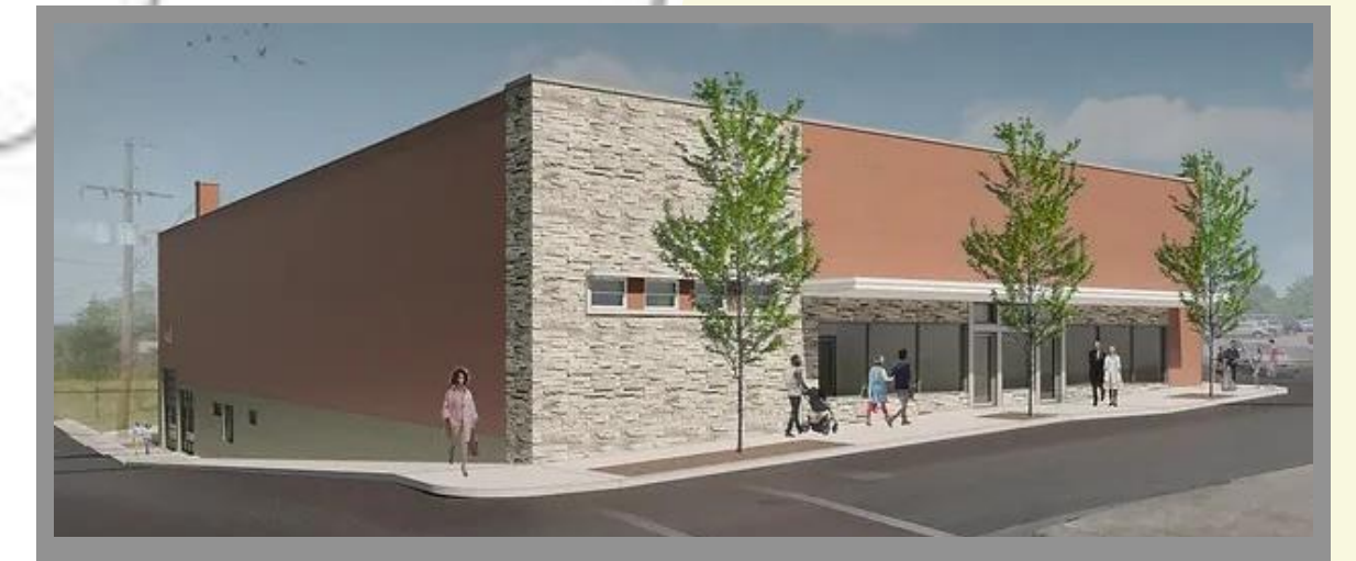
25 Studio Lofts