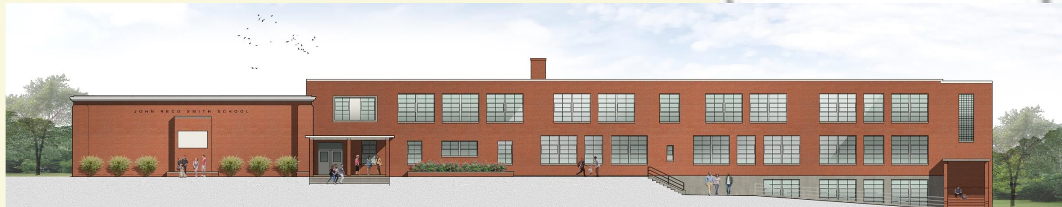
39 Apartment Homes