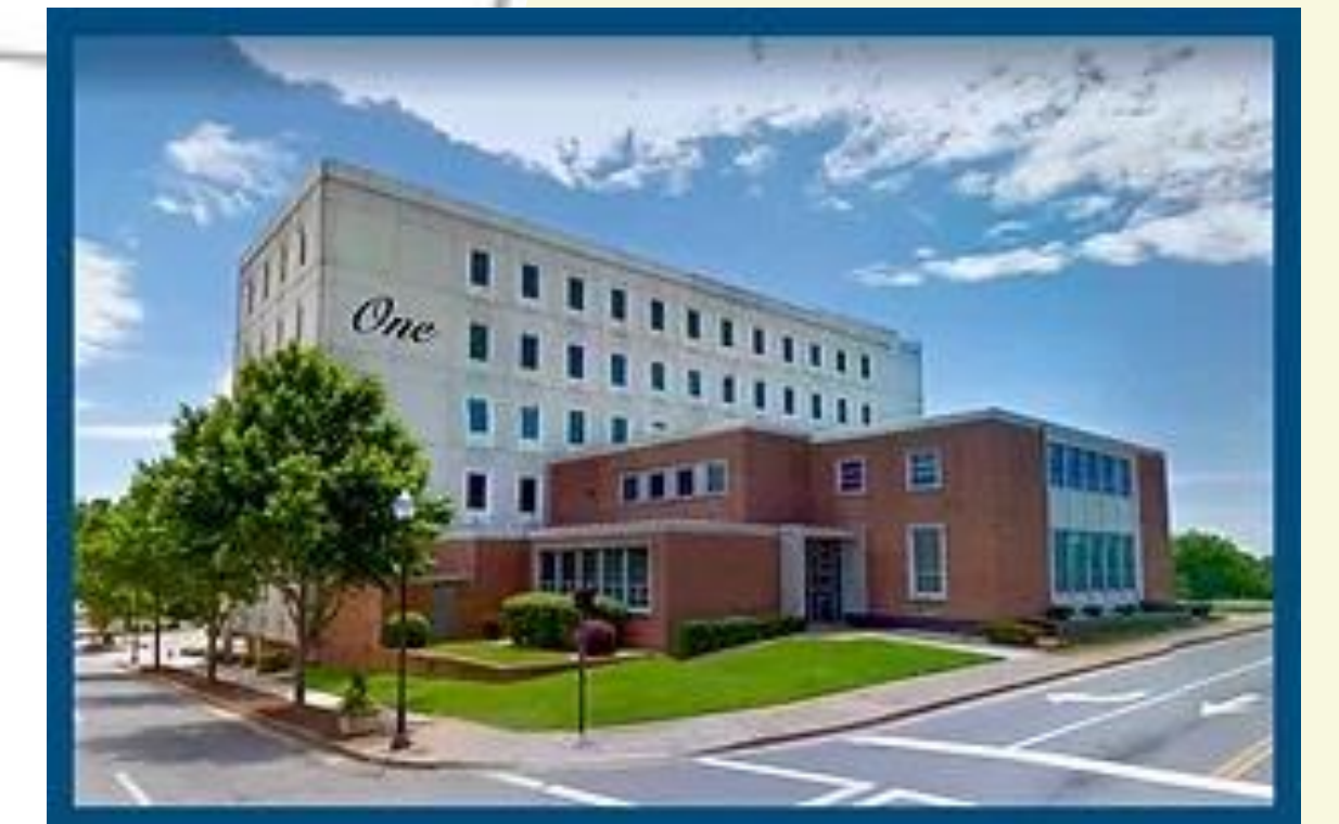
63 Apartment Residences