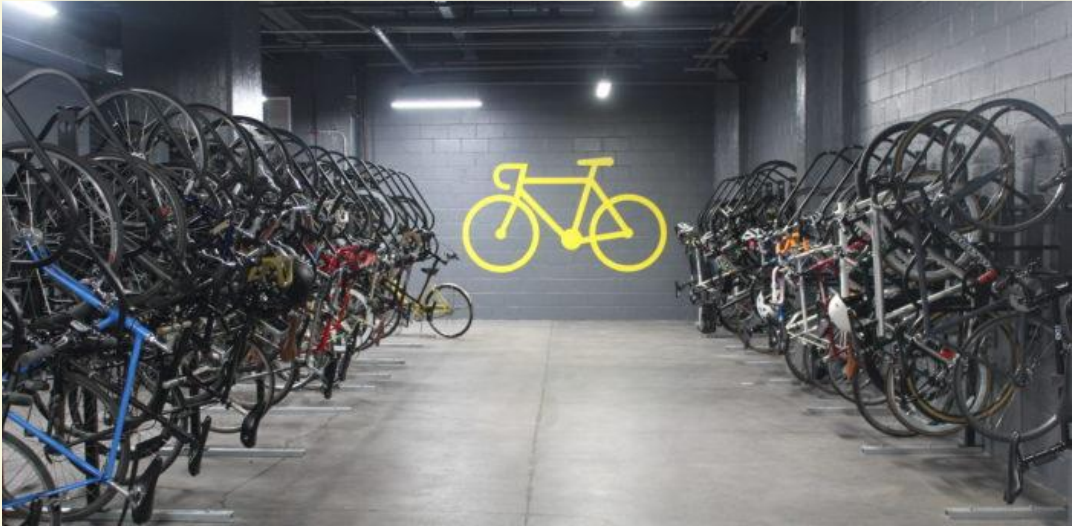
Dedicated bike garage